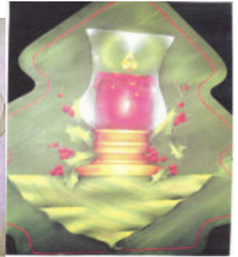
SATURDAY - JULY 17TH