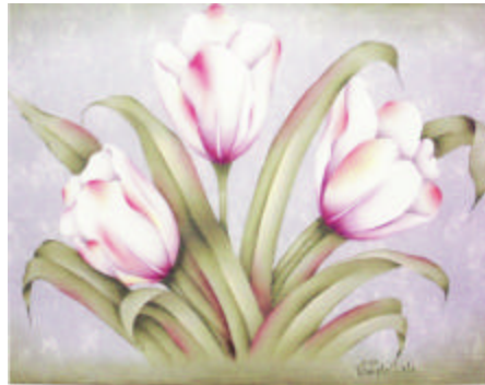
FRIDAY - JULY 16TH